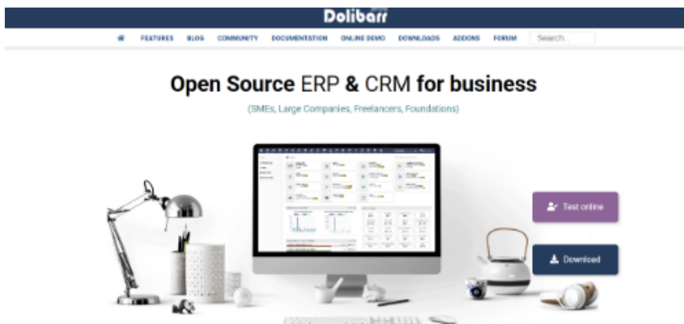
Fig. 2. & Fig.3. It provides different services with different parameters.

Fig .1. Home Page: it is a dashboard where all the folders in the root folders are listed, where tools are used to create reports, visualise data and charts that can be embedded in web-based and applications.